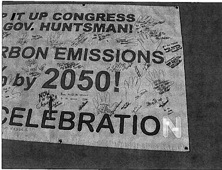
FIGURE 8. Individual political action.

that protesting, from her perspective, meant inaction. She said, “I don’t think it does a lot of good. It means people are not doing things, not taking action.” In short, the absence of collective political action from the SLC SIU solution frames could be construed as local conservative influence, but it also could reflect broader, national political-action discourses.