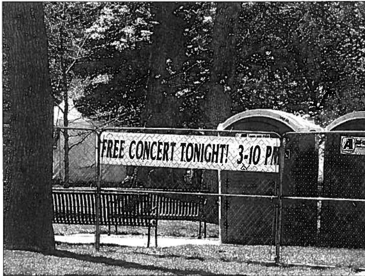
FIGURE 6. Sign at the downtown Salt Lake City SIU action.

“What is Step It Up?” This reveals a communicative disconnect between the local organizers and the people who showed up at the action. This disconnect could be communicatively managed by local organizers realizing the necessity of cultivating understanding and educating the large group of new people they attracted with the free concert about climate change. However, the main messages of the speeches given between the musical groups mismatched the awareness-raising framing of the Washington Square action. Although the speeches did emphasize and support the SIU message about climate change, they were designed not to educate or raise awareness, but to motivate people who already believed in the need to cut CO 2 emissions and in the SIU campaign. For example, the emcee repeatedly called for the audience to “step it up” without explaining what SIU was. And, a speech by a local university professor gave attendees a